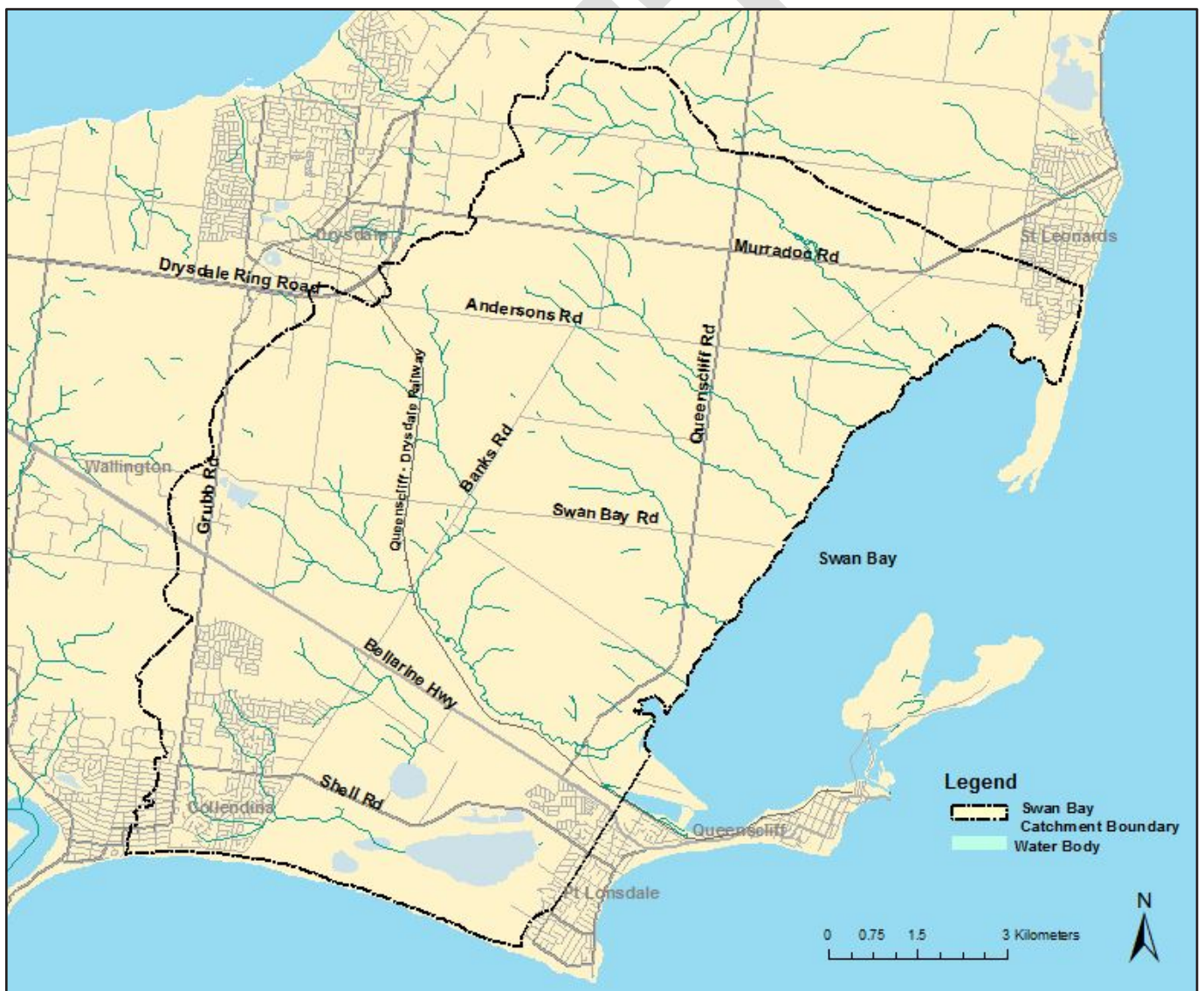
Figure 1. Map showing the Swan Bay Catchment Area

The program's aim is to reinvigorate, link and improve a range of habitats across the Bellarine including saltmarsh, coastal woodland, grassy woodland, waterways, and wetlands.